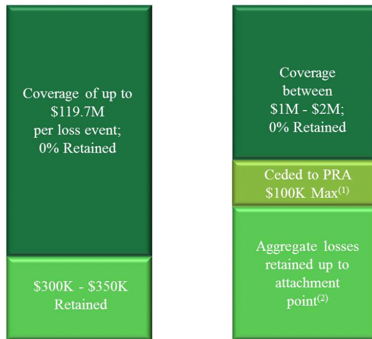
Per Occurrence Coverage